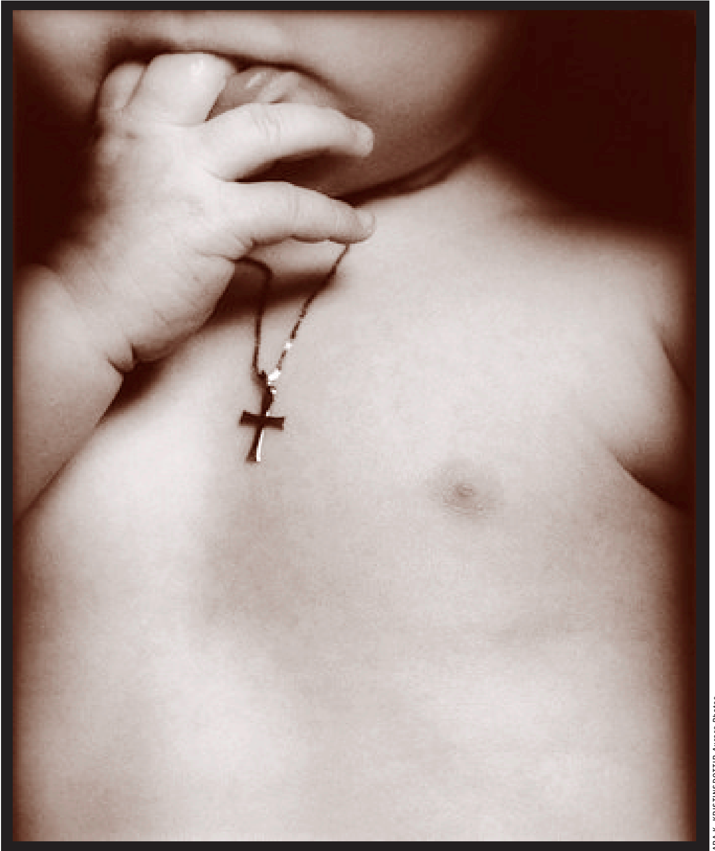
BARA K. KRISTINSDOTTIR Aurora Photos